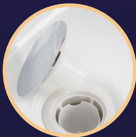
Quick & Easy Maintenance

Options for individual use or communal ablution areas.