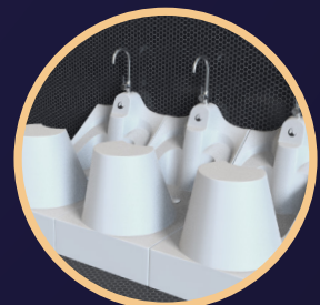
Simple Communal Integration